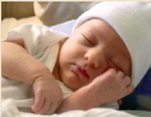
Isauroka oke oï

Añave jekuaeño yaecha jare yaikuatia ñande kuatiarirupe puaë (o)